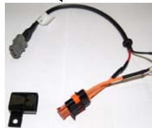
Pre Jan 2015