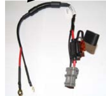
Post Jan 2015